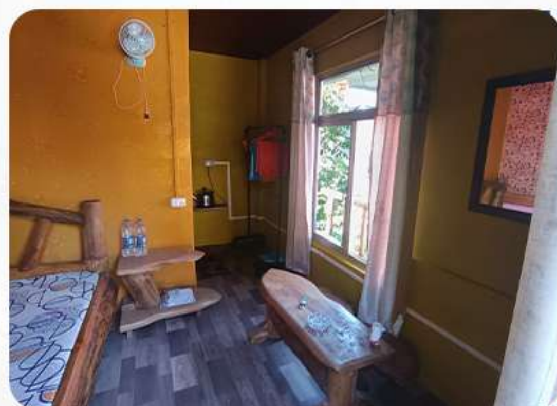
Greenhills Homestay, Reiek or Similar.