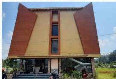
All Season Residency, Havelock Island or Similar