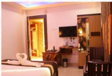
Mahira Residency, Port Blair or Similar