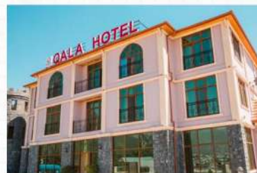
Ruma Qala Hotel, Sheki or Similar.