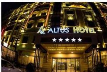
Altus Hotel, Baku or Similar.