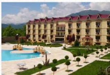
Qebele Yeddi Gozel Hotel, Gabala or Similar.