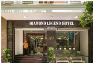
Diamond Legend Hotel, Hanoi or Similar