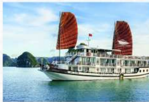
Le Journey Cruise, Halong Bay or Similar