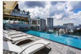
The Arrivals Hotel, Ho Chi Minh or Similar