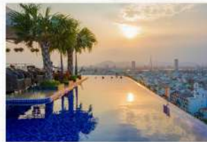
Sea Queen Hotel, Da Nang or Similar