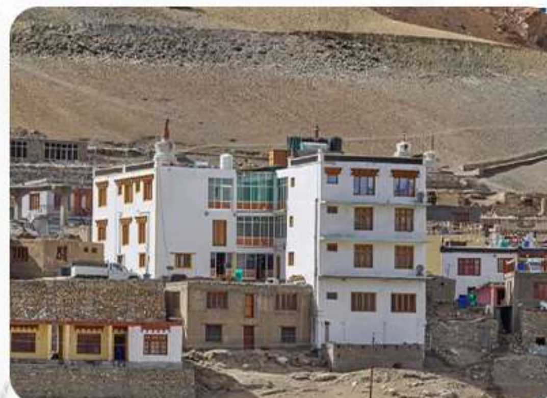
Hotel Lake View, Tsomoriri or Similar.