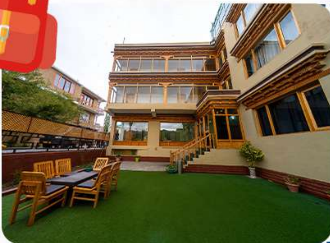
Ladakh Imperial, Leh or Similar.