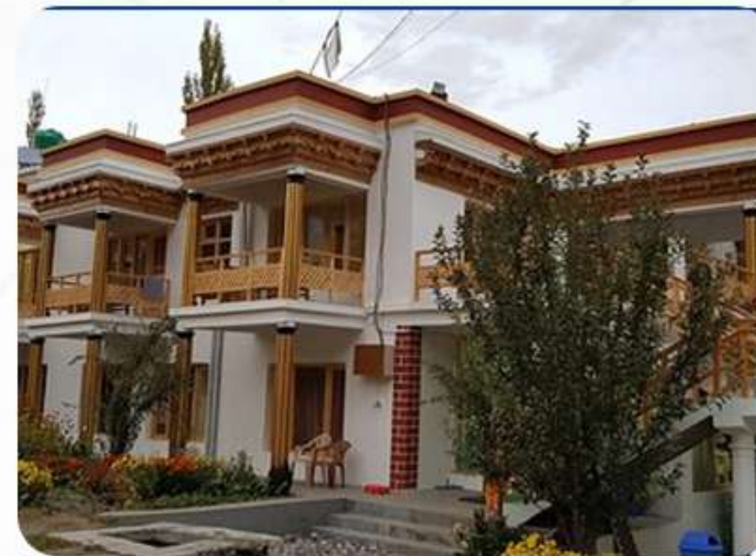
Organic Boutique, Hunder Nubra Valley or Similar.