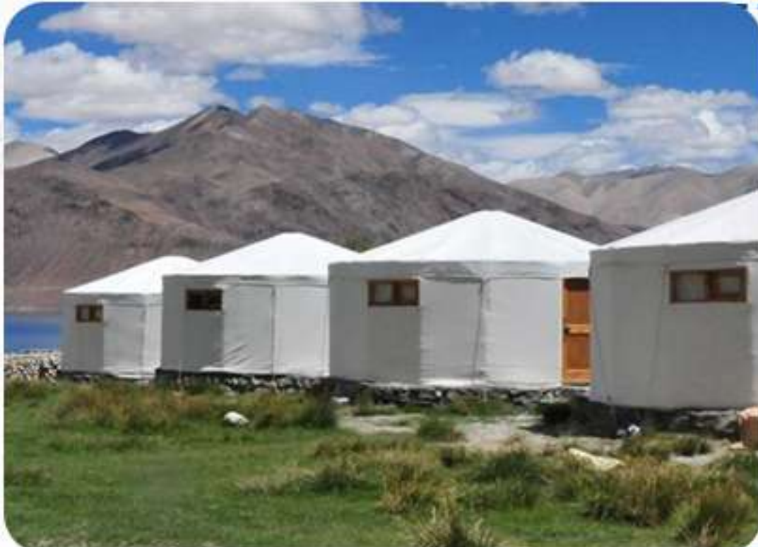
Moonland Cottage, Pangong or Similar.