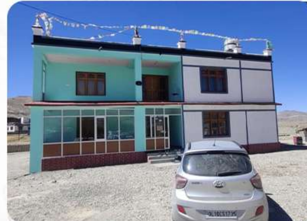
Holiday Inn, Hanle or Similar.