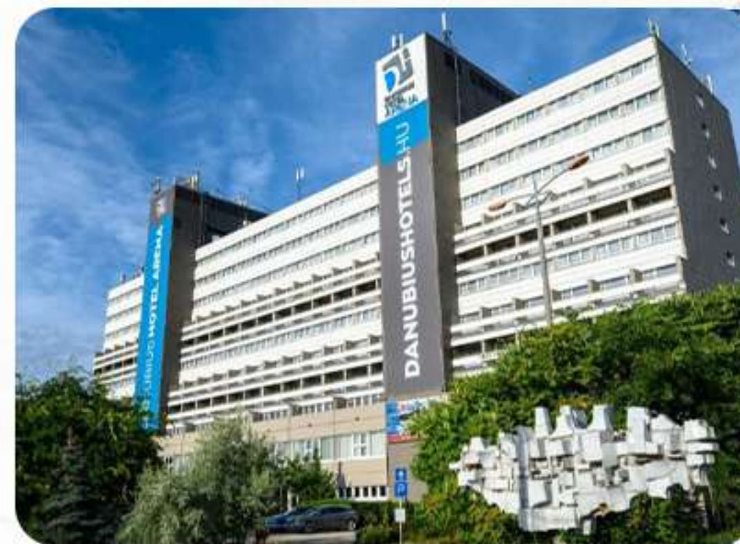
Danubius Arena or similar in Budapest.