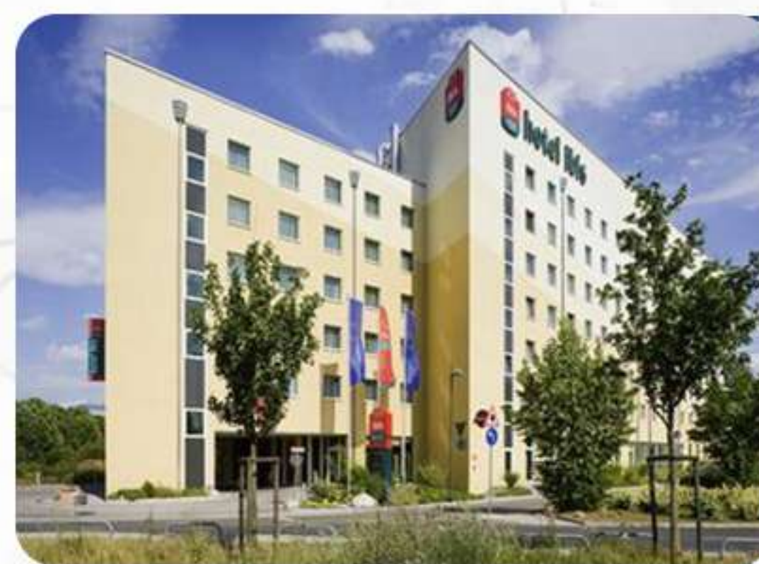
Ibis Frankfurt City Messe or similar in Frankfurt.