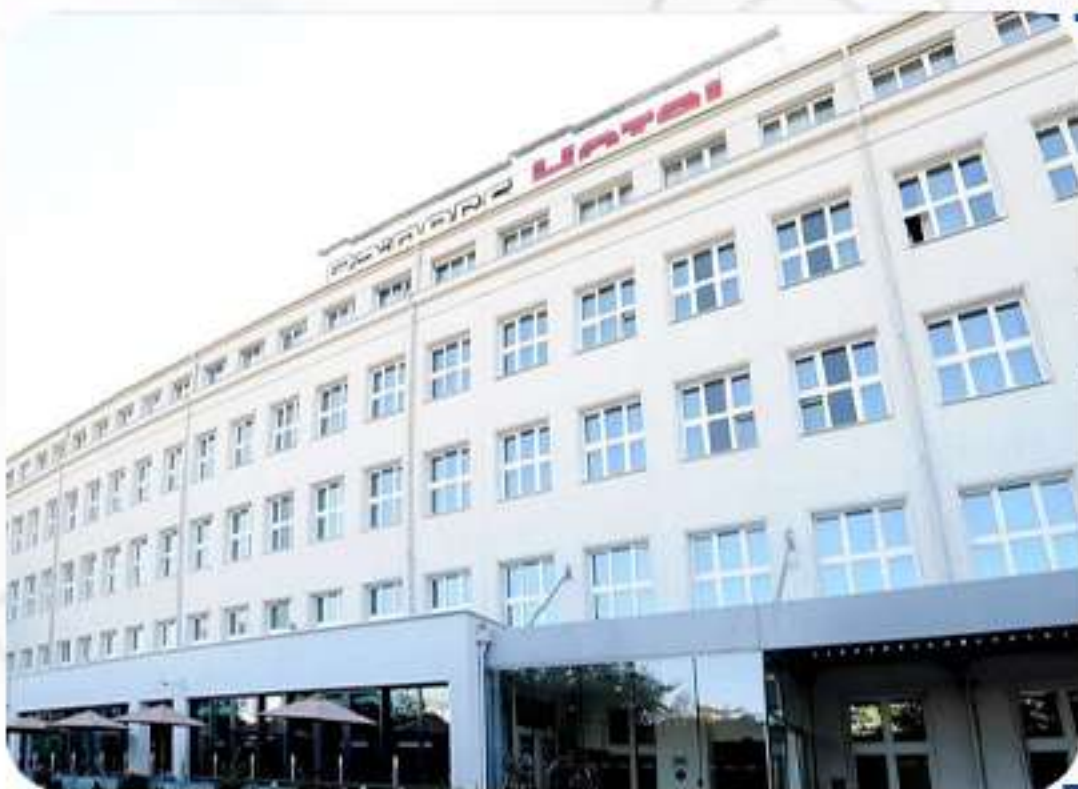
Rainers Hotel or similar in Vienna.