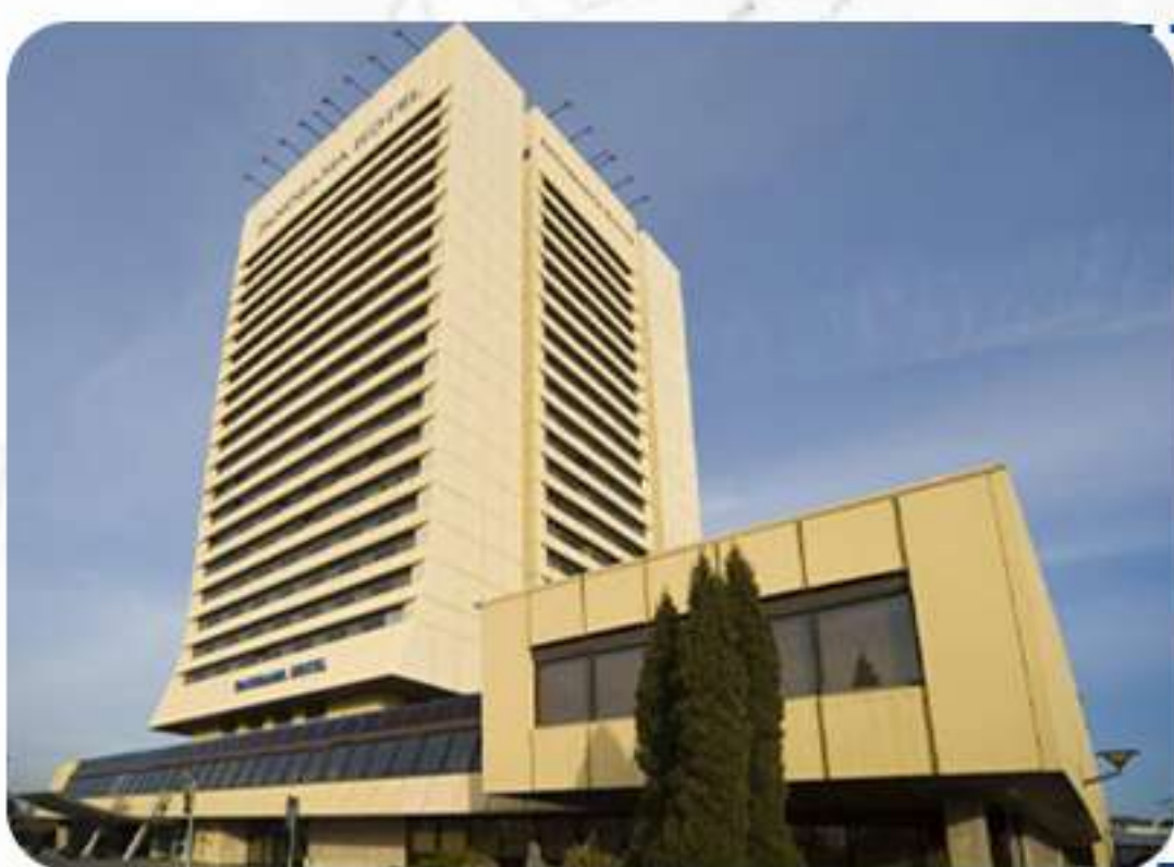
Panorama Hotel or similar in Prague.