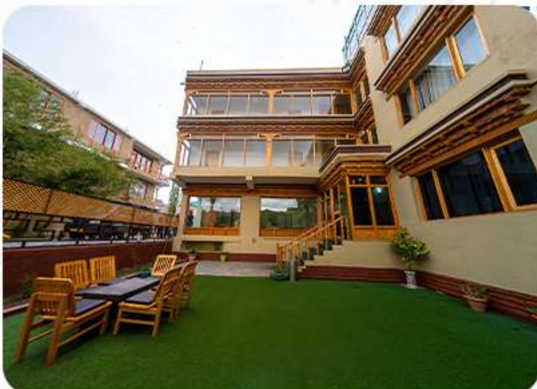
Ladakh Imperial, Leh or Similar.