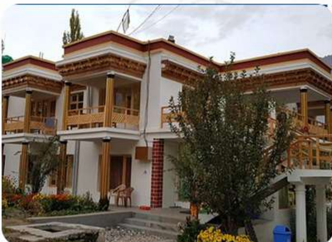
Organic Boutique Hunder, Nubra Valley or Similar.