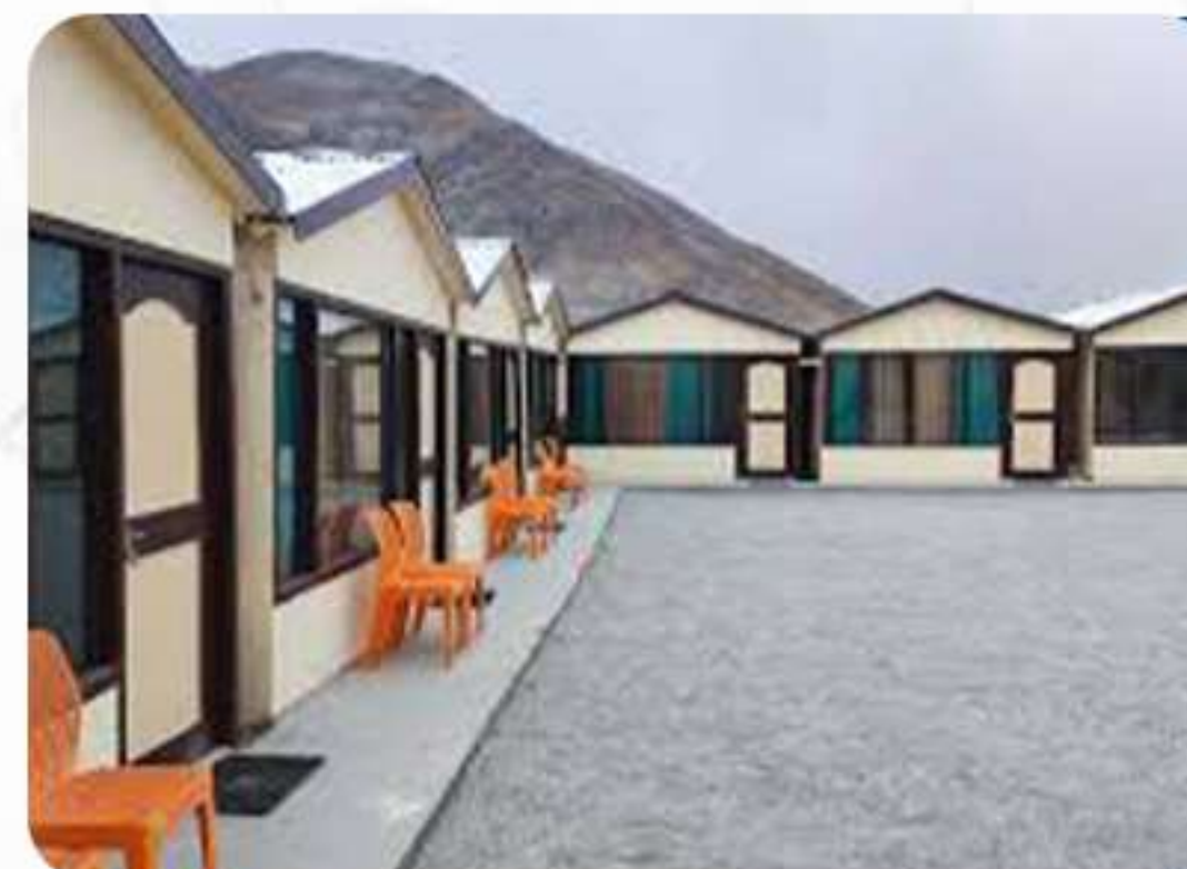
Moonland Cottage, Pangong or Similar.