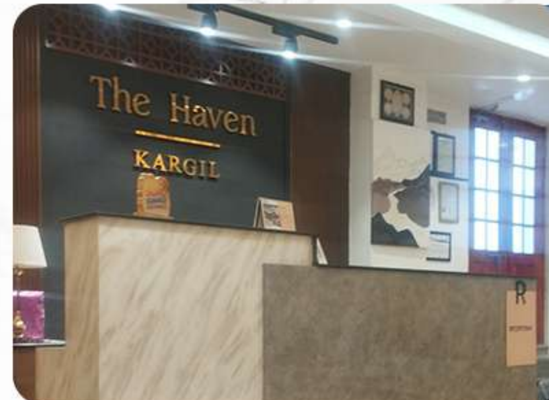
The Haven Hotel, Kargil or Similar.