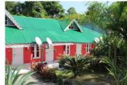
Kaziranga Resort or Similar