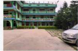
Hotel Snow Lion or Similar