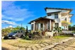
La Kupar Inn cherapunjee or Similar