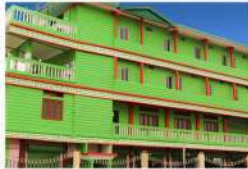
SHotel Green View, Bomdila or Similar