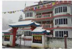
Enchanting Tawang or Similar