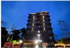
RJB Grand, Guwahati or Similar