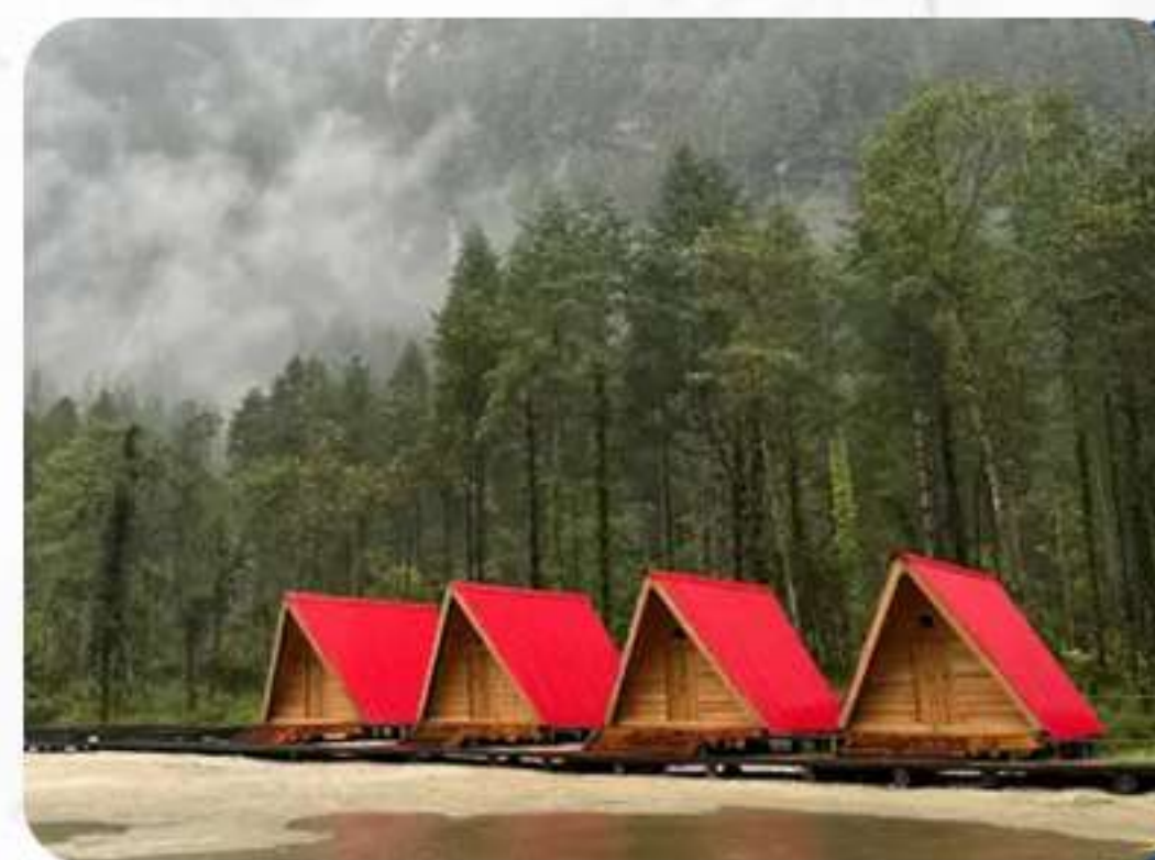
Chigu Camp, Anini or Similar.