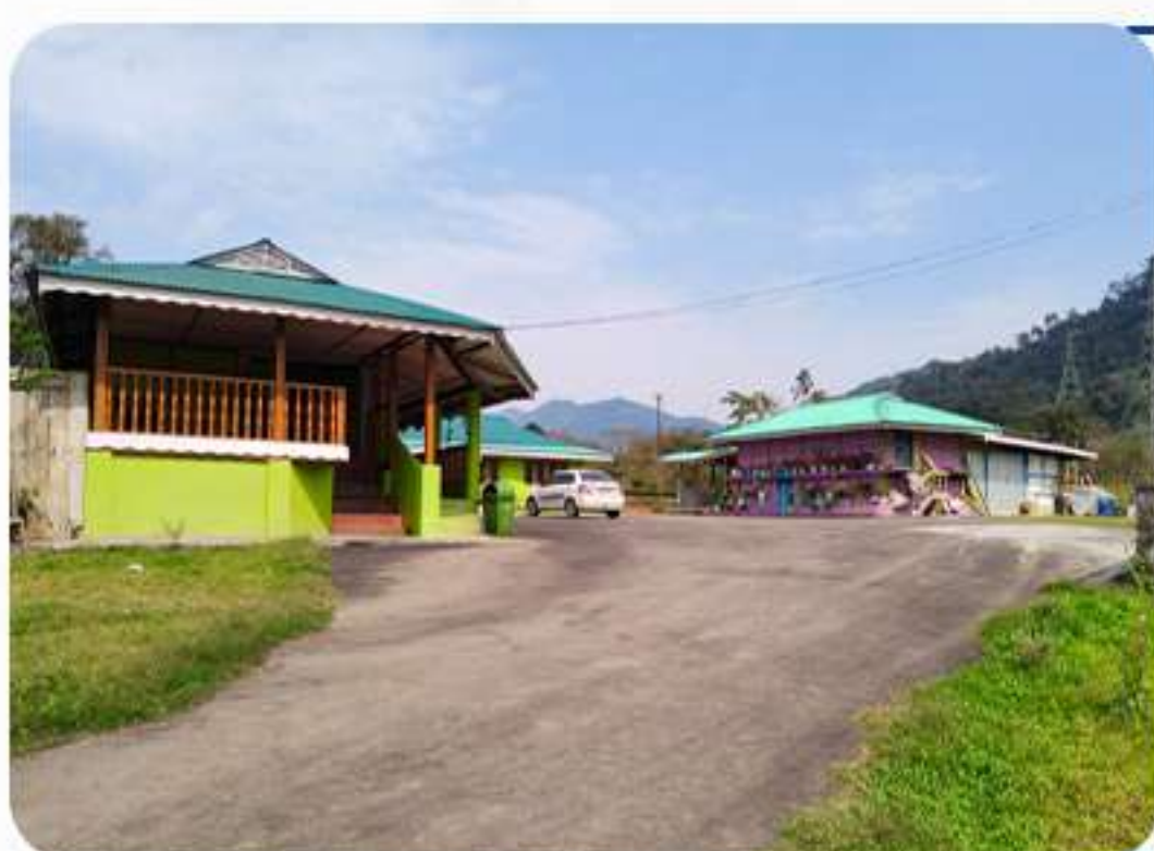
Homestay in Tezu, Tezu or Similar.