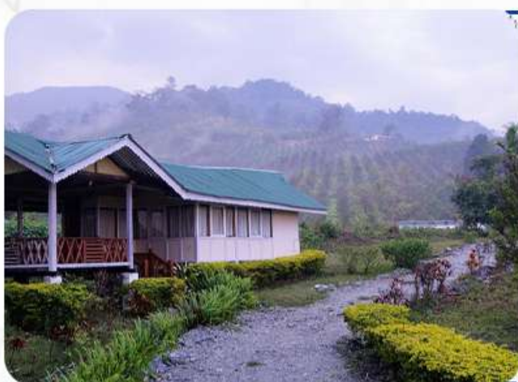
Homestay in Roing, Roing or Similar.