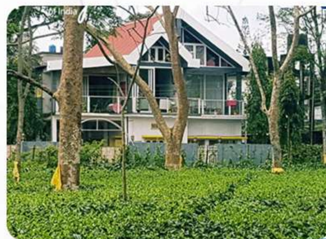
Homestay in Dibrugarh, Dibrugarh or Similar.