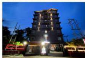
RJB Grand, Guwahati or Similar