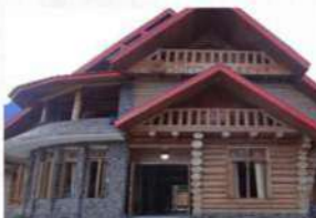
Siiro Resort, Ziro Valley or Similar