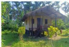
Lalimou Camp, Nameri or Similar