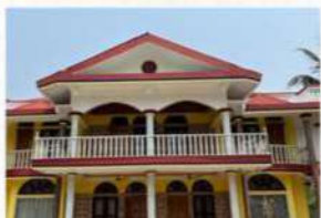
Ita fort hotel, Itanagar or Similar