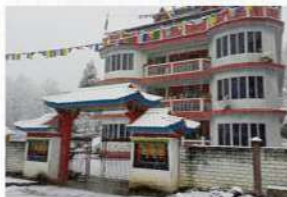
Enchanting Tawang or Similar