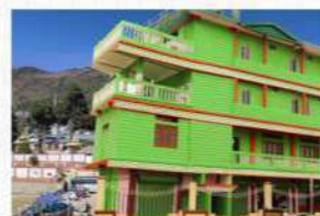
Hotel Green View, Bomdila or Similar