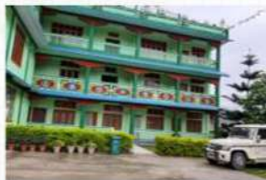
Hotel Snow Lion, Dirang or Similar