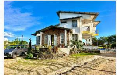
ShillongLa Kupar Inn cherapunjee or Similar