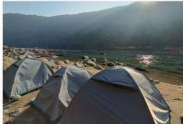
ShillongRiverRuns campsite Shnongpdeng or Similar