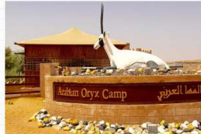
Arabian Oryx Camp, Wahiba Sands or Similar