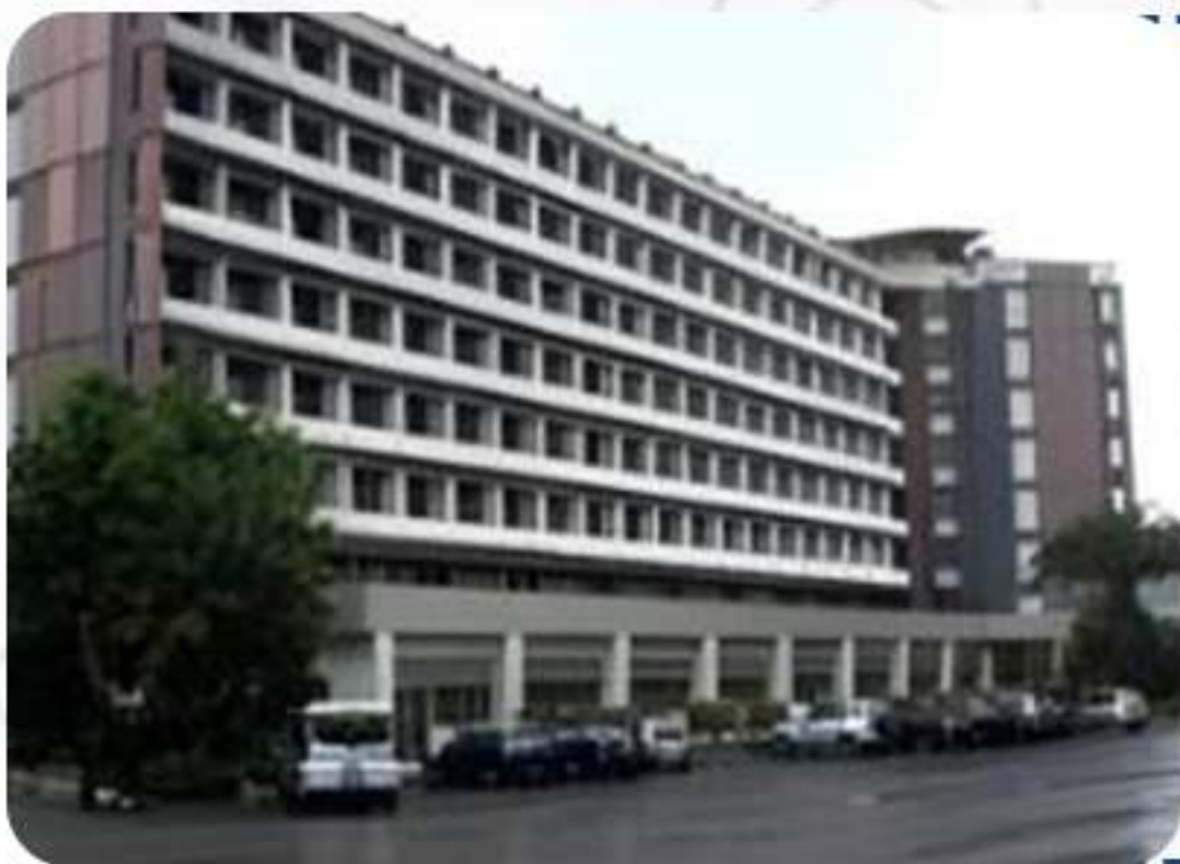
Hotel Ergife or similar in Rome.