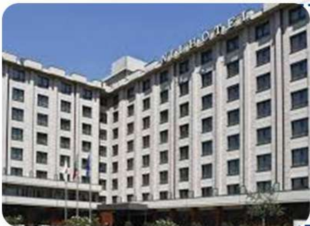
Nilhotel or similar in Florence.