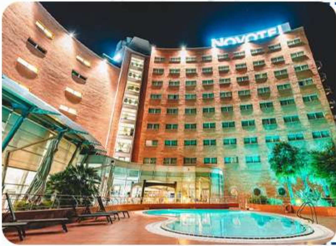
Novotel Mestre Castellana or similar in Venice Mestre.