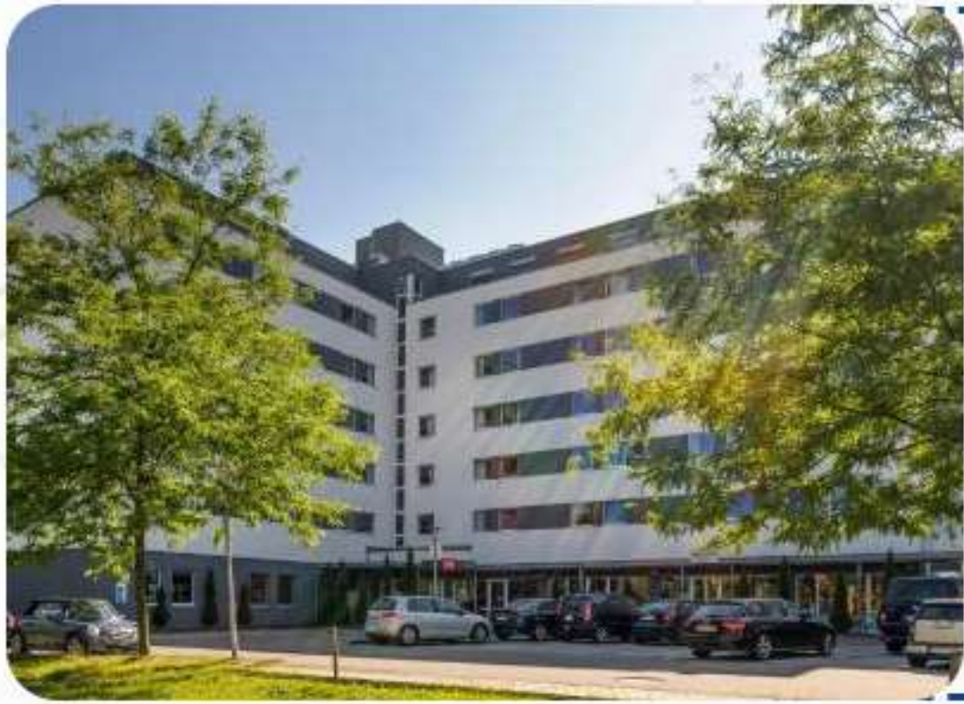
Hotel Ibis Zurich Messe Airport or similar in Zurich.