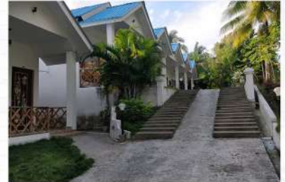
Laxmi Continental Resort, Neil Island or Similar