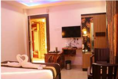
Mahira Residency, Port Blair or Similar