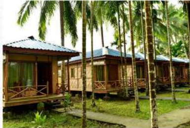
Radha Krishna Resort, Havelock Island or Similar