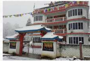
Enchanting Tawang or Similar