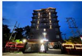
RJB Grand, Guwahati or Similar