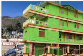
Hotel Green View, Bomdila or Similar