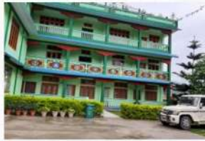
Hotel Snow Lion, Dirang or Similar