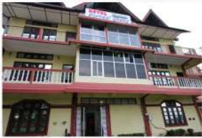
Wanga Tsang Bhalukpong or Similar