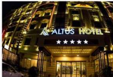
Altus Hotel, Baku or Similar.