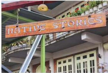
Native Stories, Kigwema or Similar