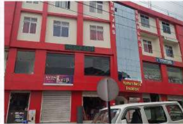
Yaotsu's Bed & Breakfast, Kohima or Similar