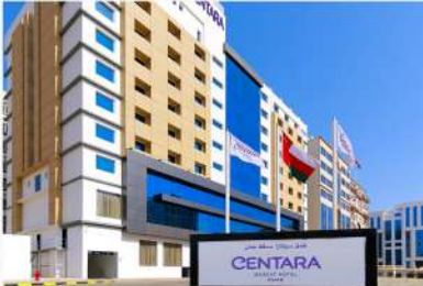
Centra By Centara Muscat Dunes Hotel, Muscat or Similar