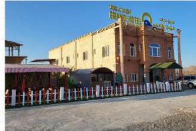
Jabal Al Akhdar Grand Hotel, Jabal Al Akhdar or Similar