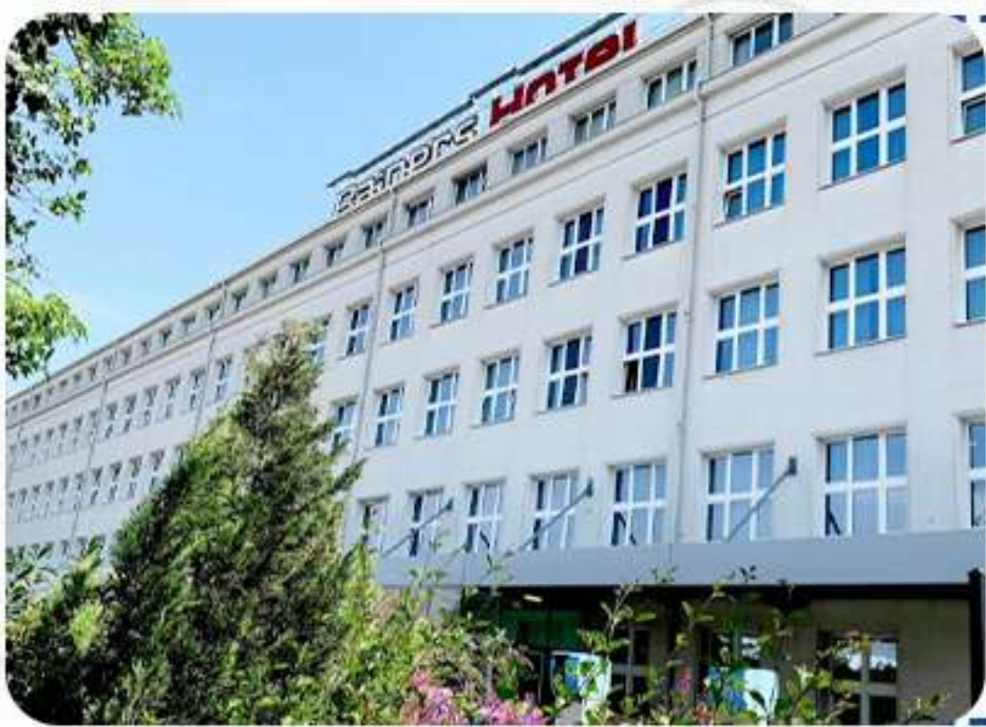
Rainers Hotel or similar in Vienna.