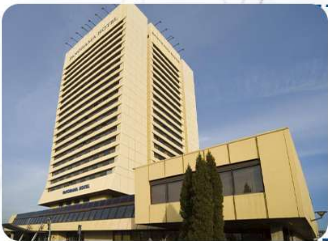
Panorama Hotel or similar in Prague.