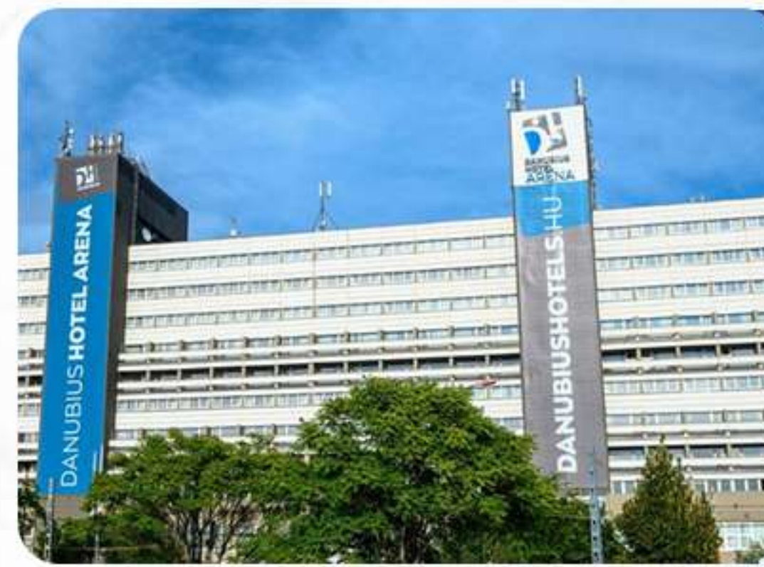
Danubius Arena or similar in Budapest.