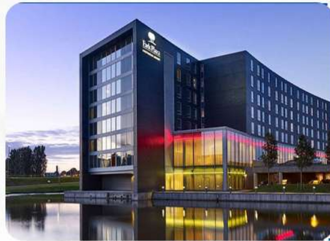
Park Plaza Amsterdam Airport or similar in Amsterdam.