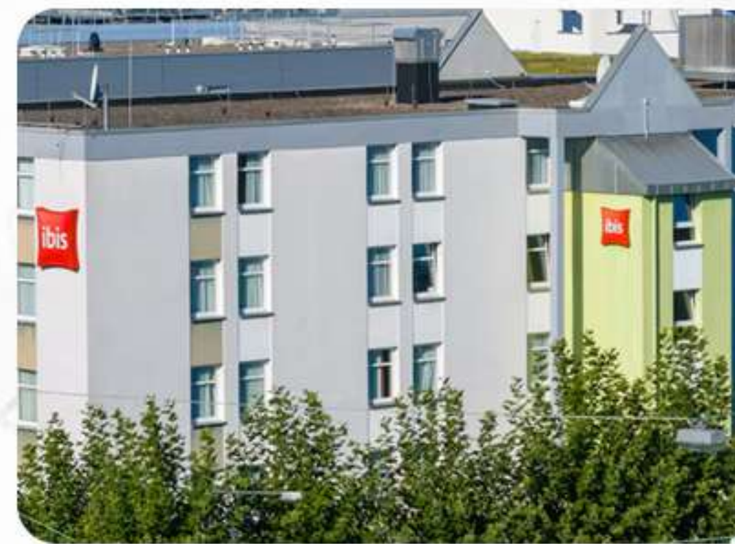
Ibis Frankfurt City Messe or similar in Frankfurt.