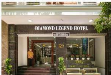
Diamond Legend Hotel, Hanoi or Similar