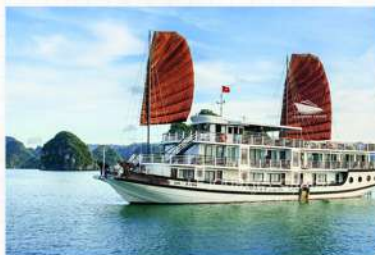
Le Journey Cruise, Halong Bay or Similar