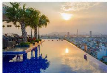
Sea Queen Hotel, Da Nang or Similar