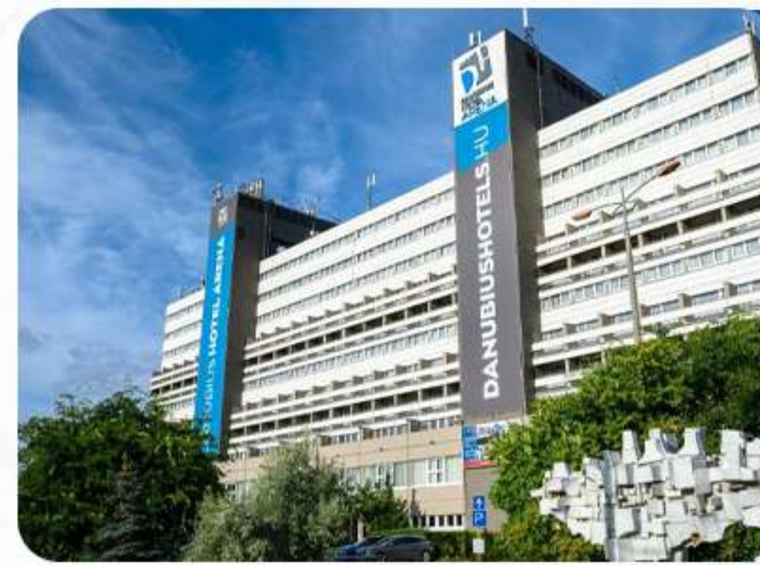
Danubius Arena or similar in Budapest.