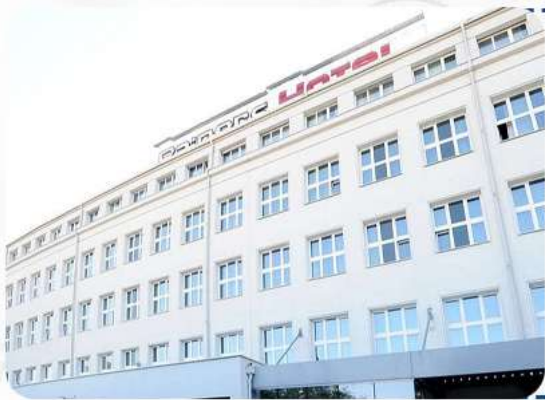
Rainers Hotel or similar in Vienna.