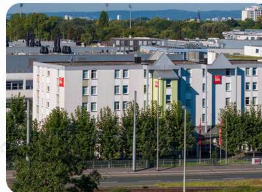
Ibis Frankfurt City Messe or similar in Frankfurt.