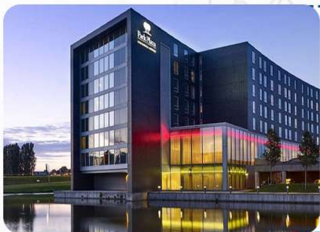
Park Plaza Amsterdam Airport, or similar in Amsterdam.