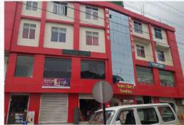
Yaotsu's Bed & Breakfast, Kohima or Similar