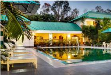
Kaziranga Resort or Similar