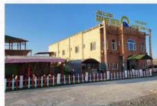
Jabal Al Akhdar Grand Hotel, Jabal Al Akhdar or Similar