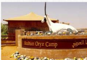
Arabian Oryx Camp, Wahiba Sands or Similar