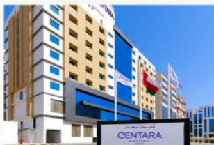
Centra By Centara Muscat Dunes Hotel, Muscat or Similar