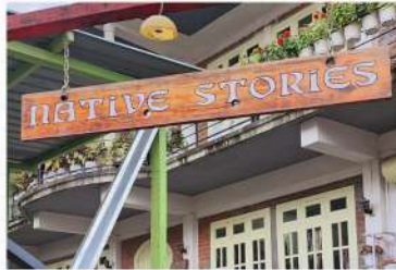
Native Stories, Kigwema or Similar