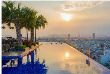
Sea Queen Hotel, Da Nang or Similar