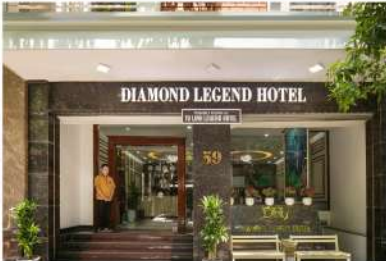
Diamond Legend Hotel, Hanoi or Similar