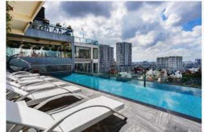
The Arrivals Hotel, Ho Chi Minh or Similar