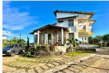
ShillongLa Kupar Inn cherapunjee or Similar