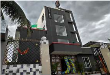
Hotel Mirana or Similar