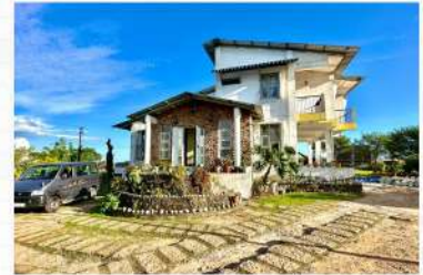
ShillongLa Kupar Inn cherapunjee or Similar