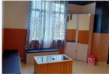
Yaotsu's Bed & Breakfast, Kohima or Similar