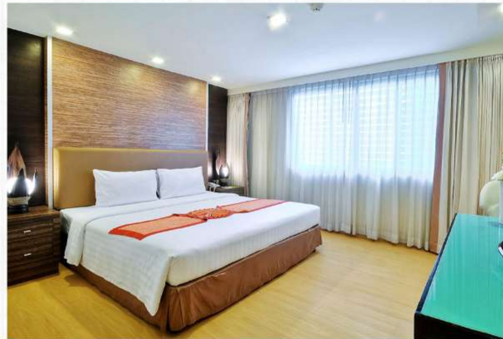
Aspen Suites Hotel, Bangkok or Similar