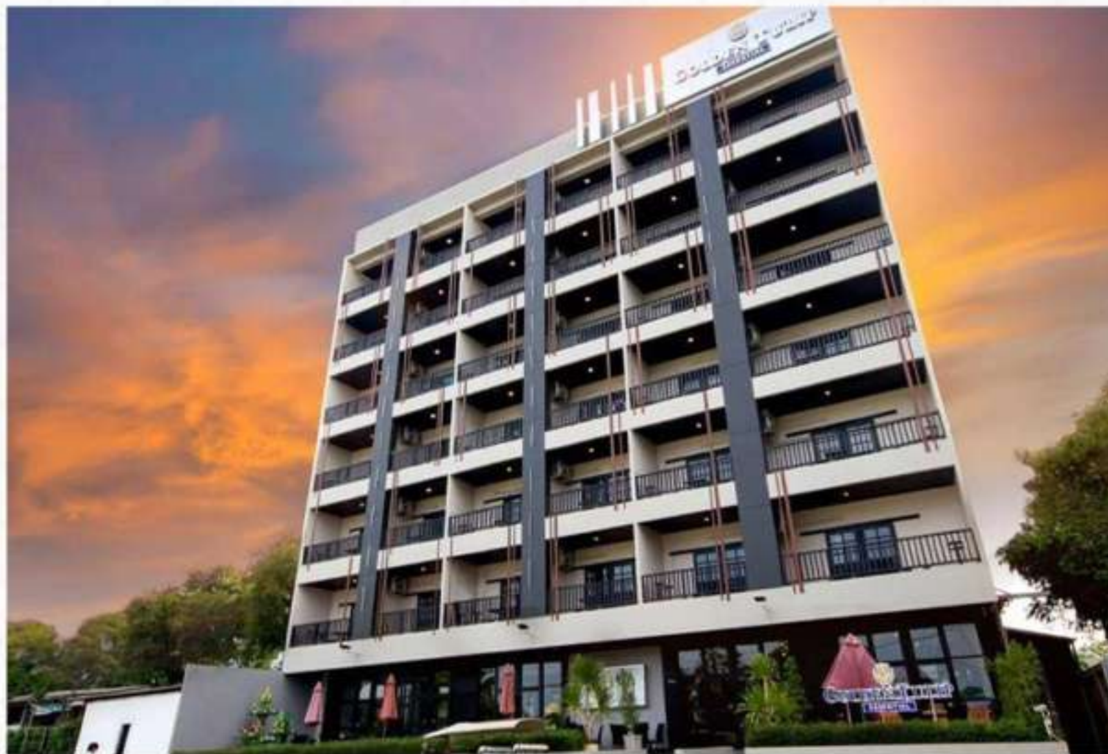
Golden Tulip Essential, Pattaya or Similar