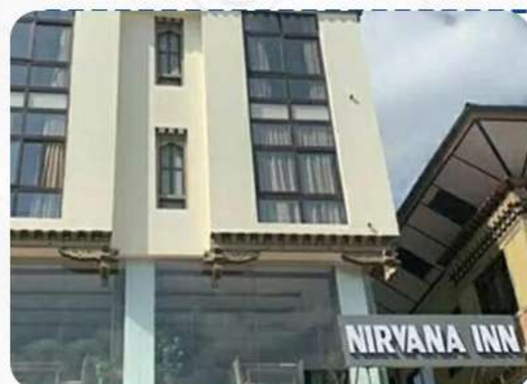
Nirvana Inn, Paro or Similar.