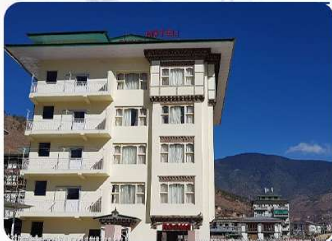
Hotel Bhutan Kubera, Thimphu or Similar.