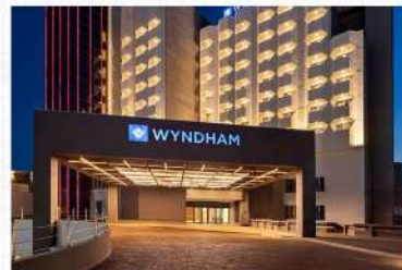
Wyndham, Bukhara or Similar.