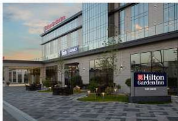
Hilton Garden Inn, Samarkand or Similar.