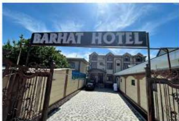
Barhat Hotel, Tashkent or Similar.