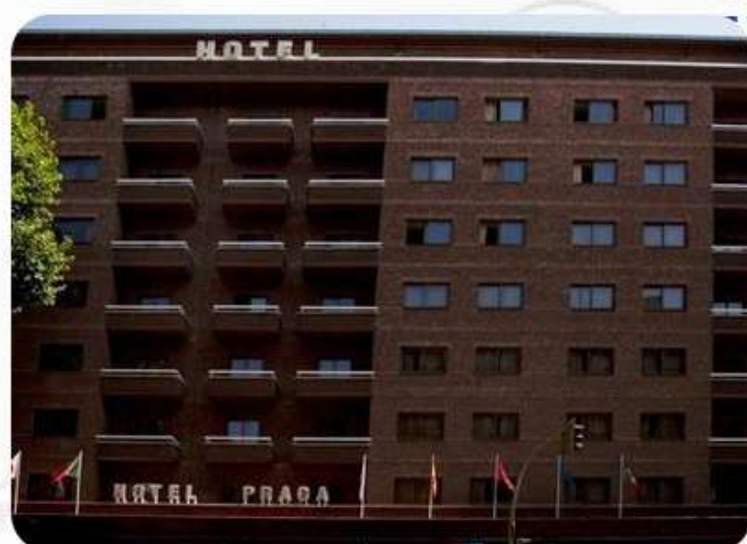
Hotel Praga or similar in Madrid.