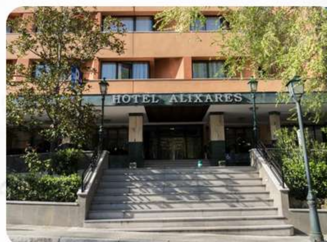
Porcel Alixares or similar in Granada.