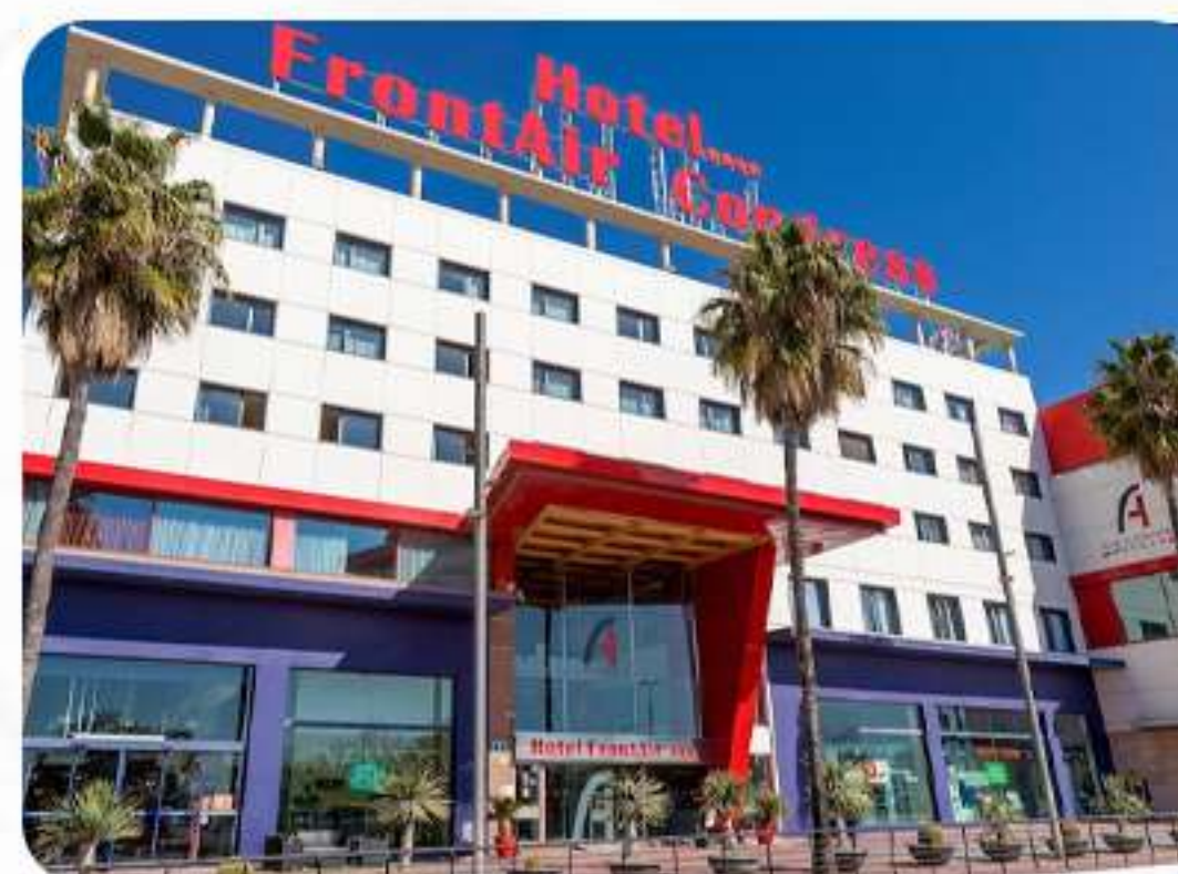
Front Air Congress or similar in Barcelona.