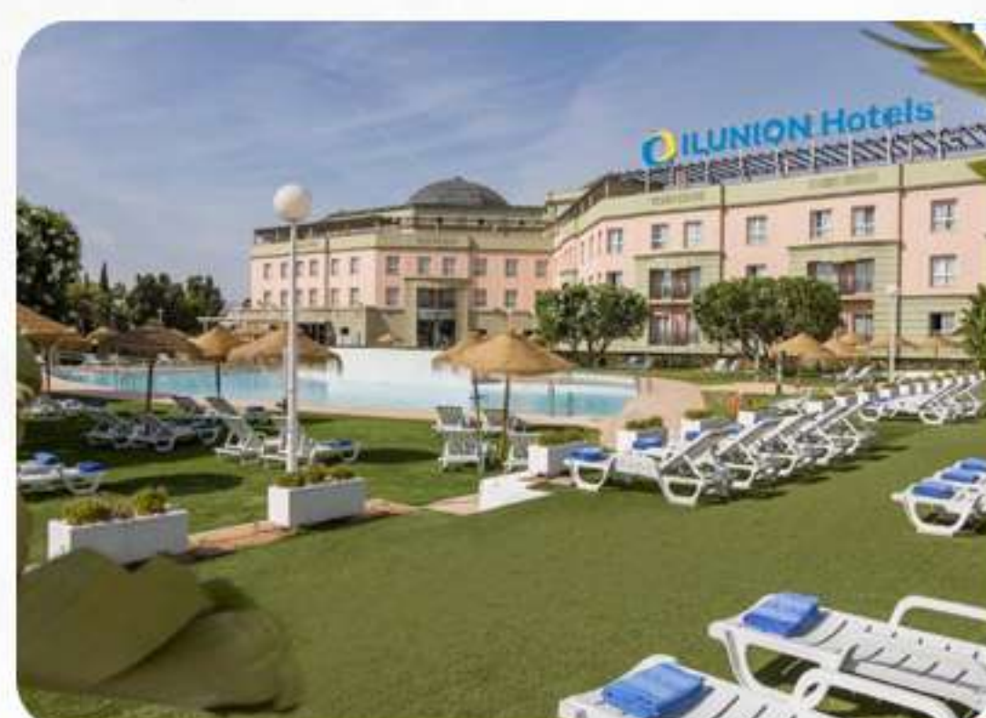
Alcora Sevilla or similar in Seville.