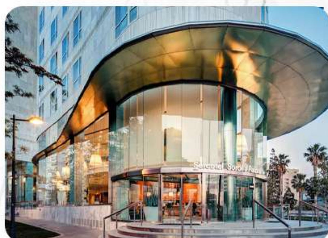
Sercotel Sorolla or similar in Valencia.