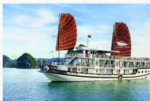
Le Journey Cruise, Halong Bay or Similar