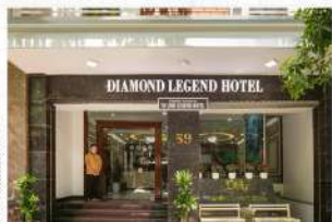
Diamond Legend Hotel, Hanoi or Similar