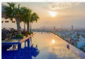
Sea Queen Hotel, Da Nang or Similar