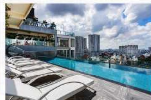
The Arrivals Hotel, Ho Chi Minh or Similar