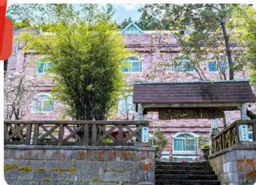
Chin Shan Villa or Similar in Chiayi.