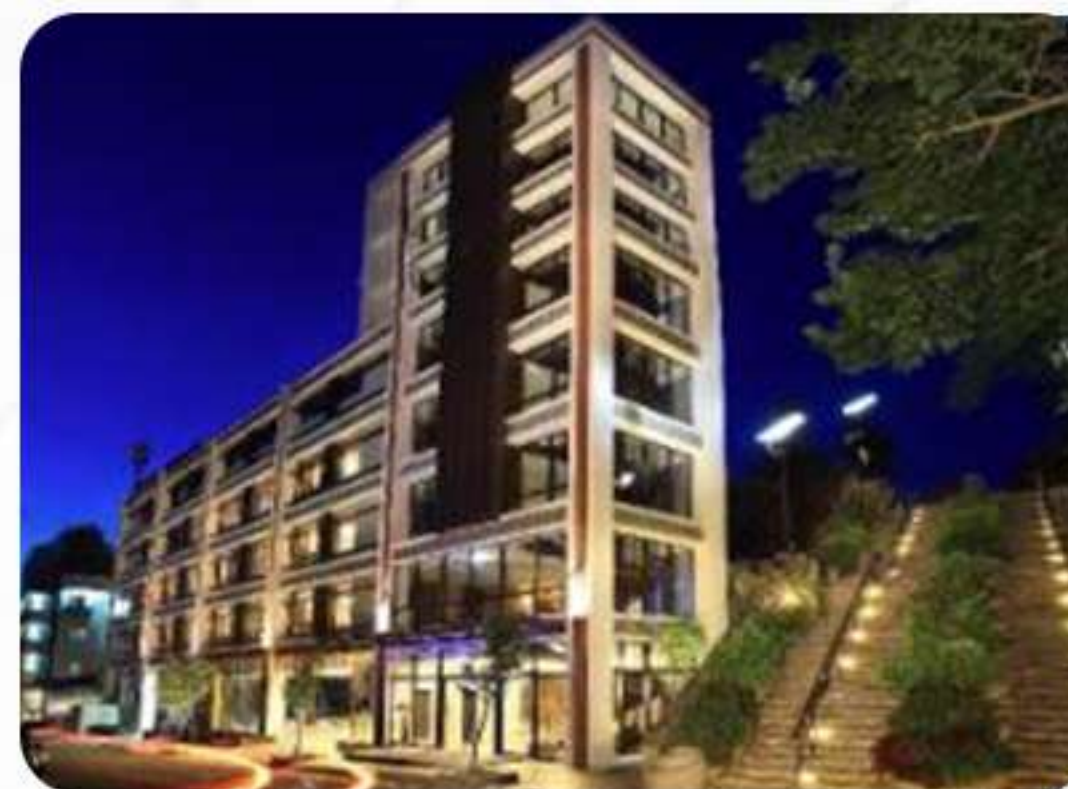
Lea Lea Hotel or Similar in Nantou.