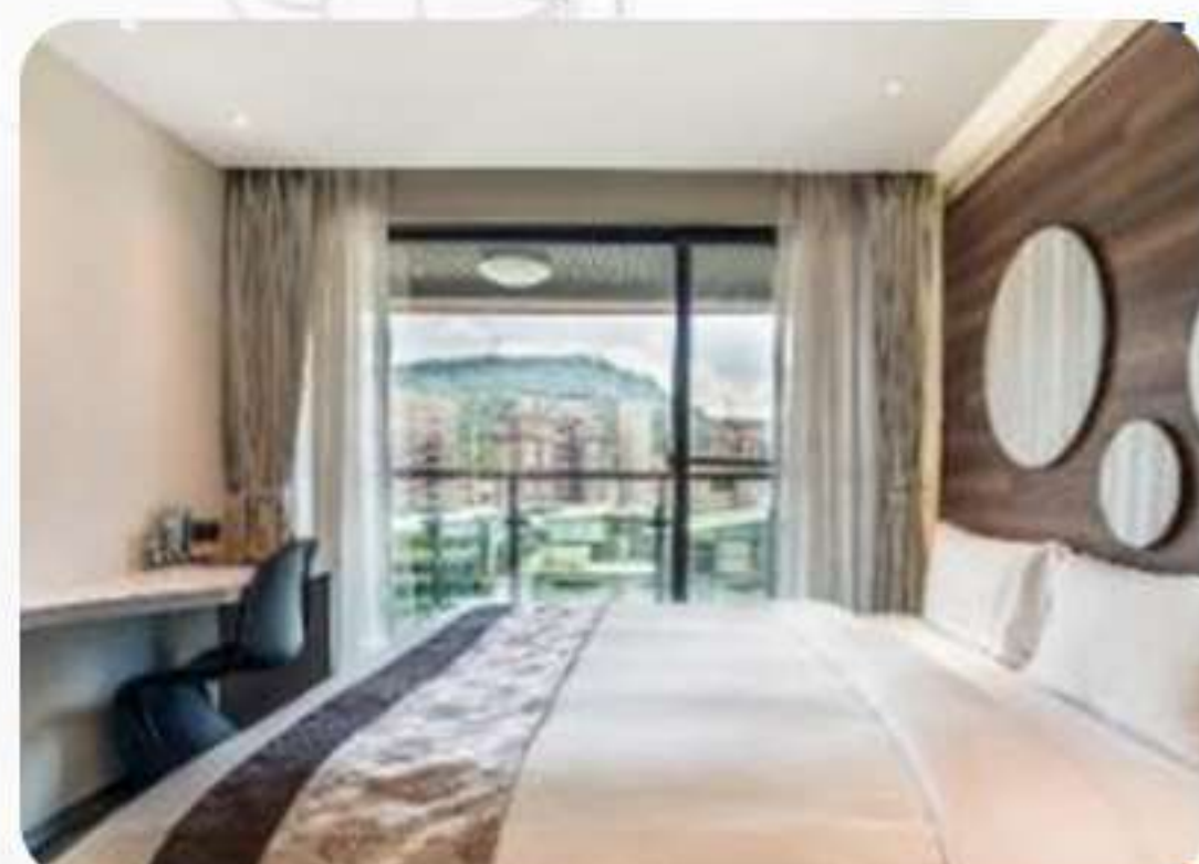
Green World Songshan or Similar in Taipei.