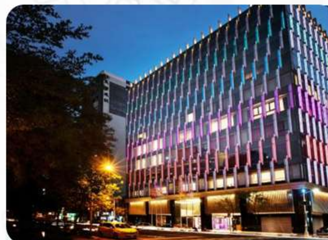
Chateau de Chine or Similar in Kaohsiung.