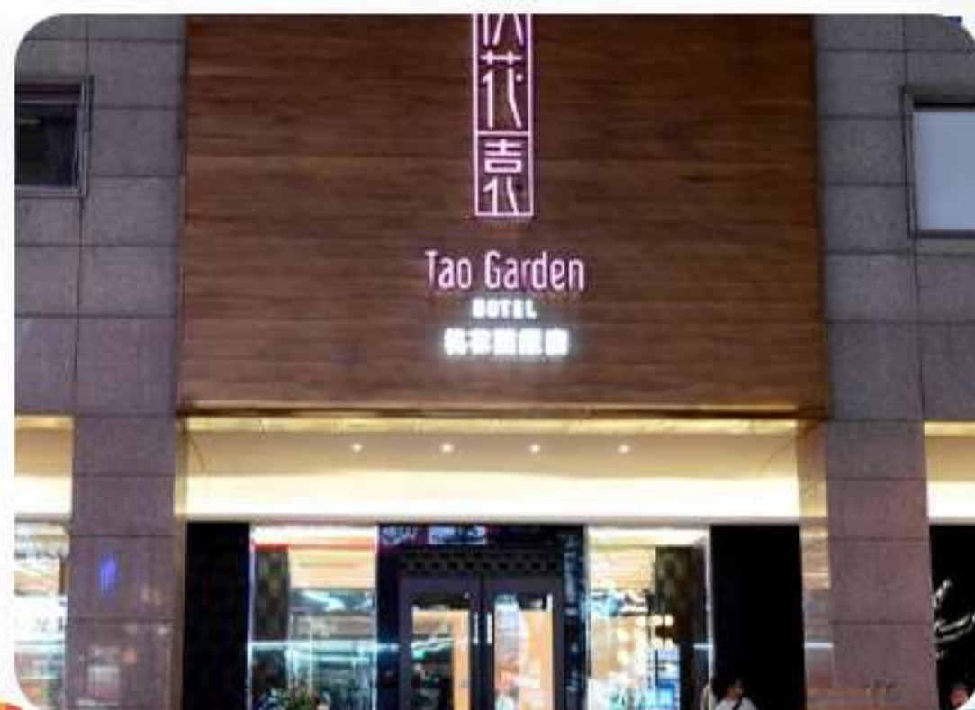
Tao Garden Hotel or Similar in Taoyuan.