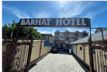
Barhat Hotel, Tashkent or Similar.