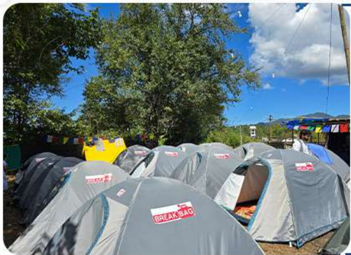
Dome 2-Sharing Tent Ziro or Similar.