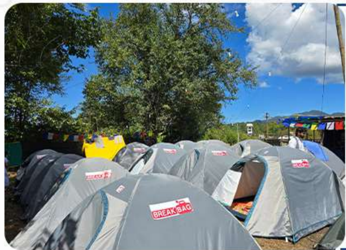
Dome 2-Sharing Tent Ziro or Similar.