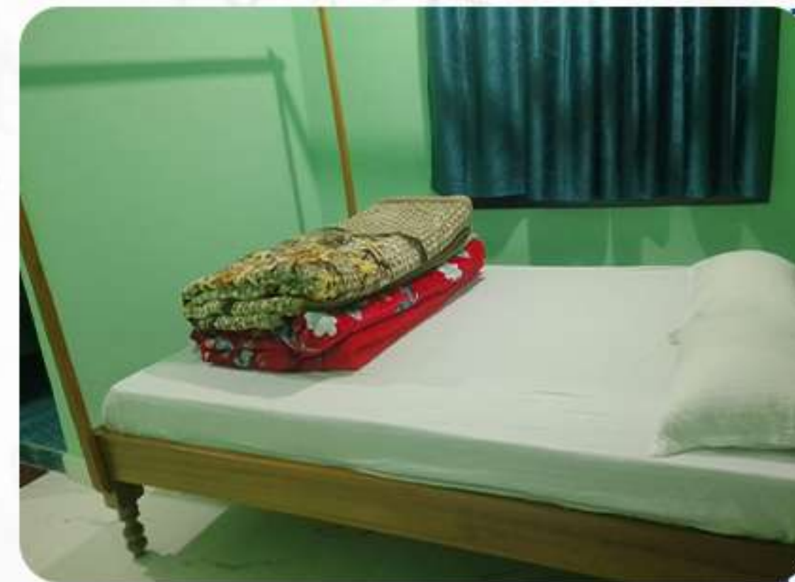
Homestay Attached Washroom or Similar.