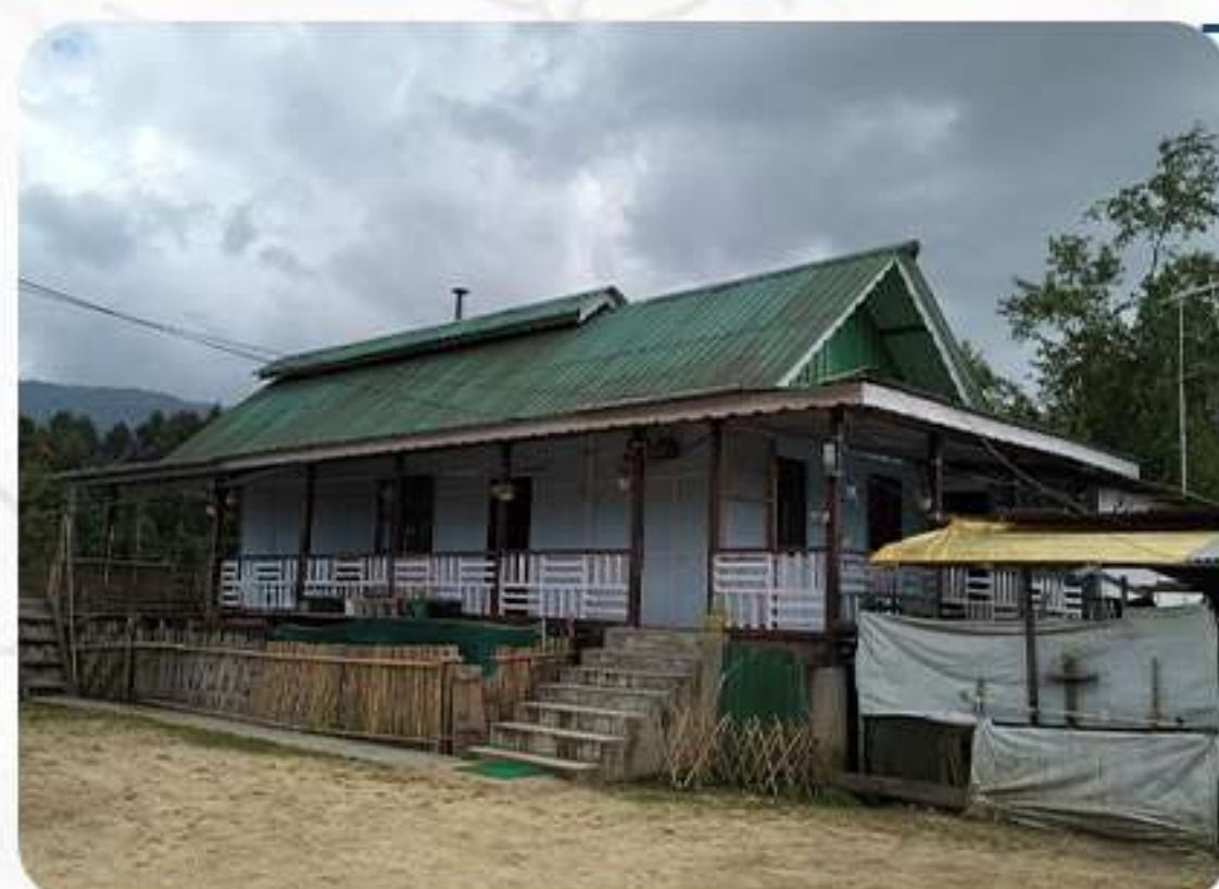
Homestay Non-Attached Washroom or Similar.